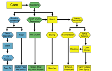
Corn Wet Milling Process